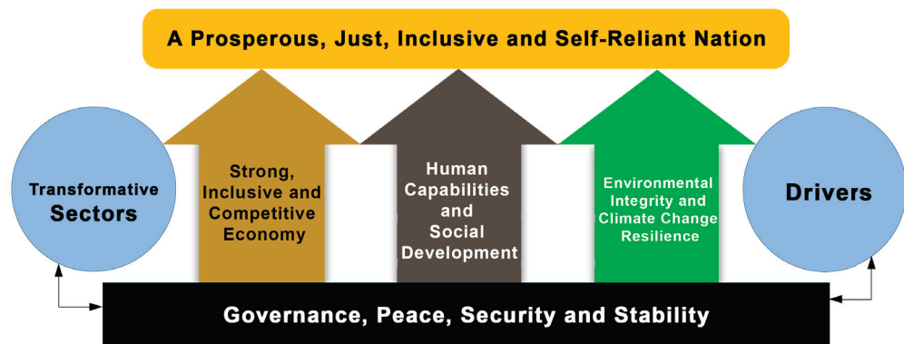
Tanzania Development Vision 2050 Framework